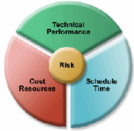
Project Management Component Circle

“Minimize the learning curve. Maximize the impact.”